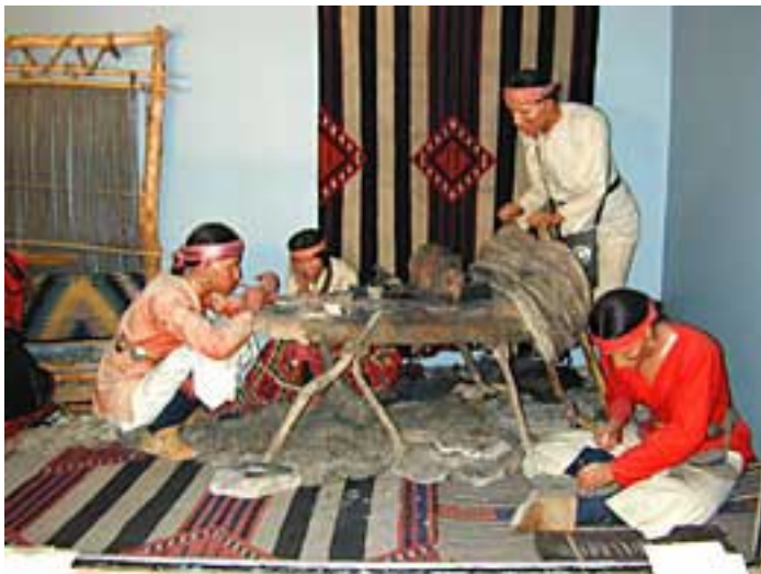
Weavers making the Official AhwahneeCon T-Shirts!

Let us remember that once we win the right to host AhwahneeCon, we're only borrowing Yosemite Valley from those who came before us. The noble Ahwahneechee tribe that inhabited the Valley for centuries before the arrival of fan. The strange thing is, the Ahwahneechee were hella fannish themselves, as evidenced by these two photos.