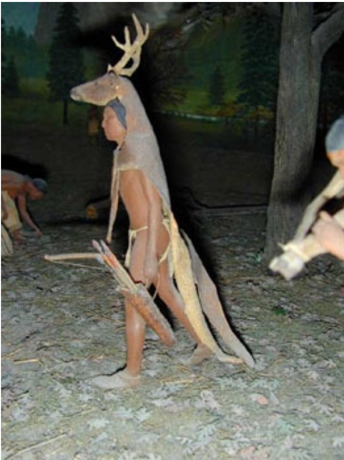
Recreation of Earliest Known Hall Costumer in Yosemite Valley

Let us remember that once we win the right to host AhwahneeCon, we're only borrowing Yosemite Valley from those who came before us. The noble Ahwahneechee tribe that inhabited the Valley for centuries before the arrival of fan. The strange thing is, the Ahwahneechee were hella fannish themselves, as evidenced by these two photos.