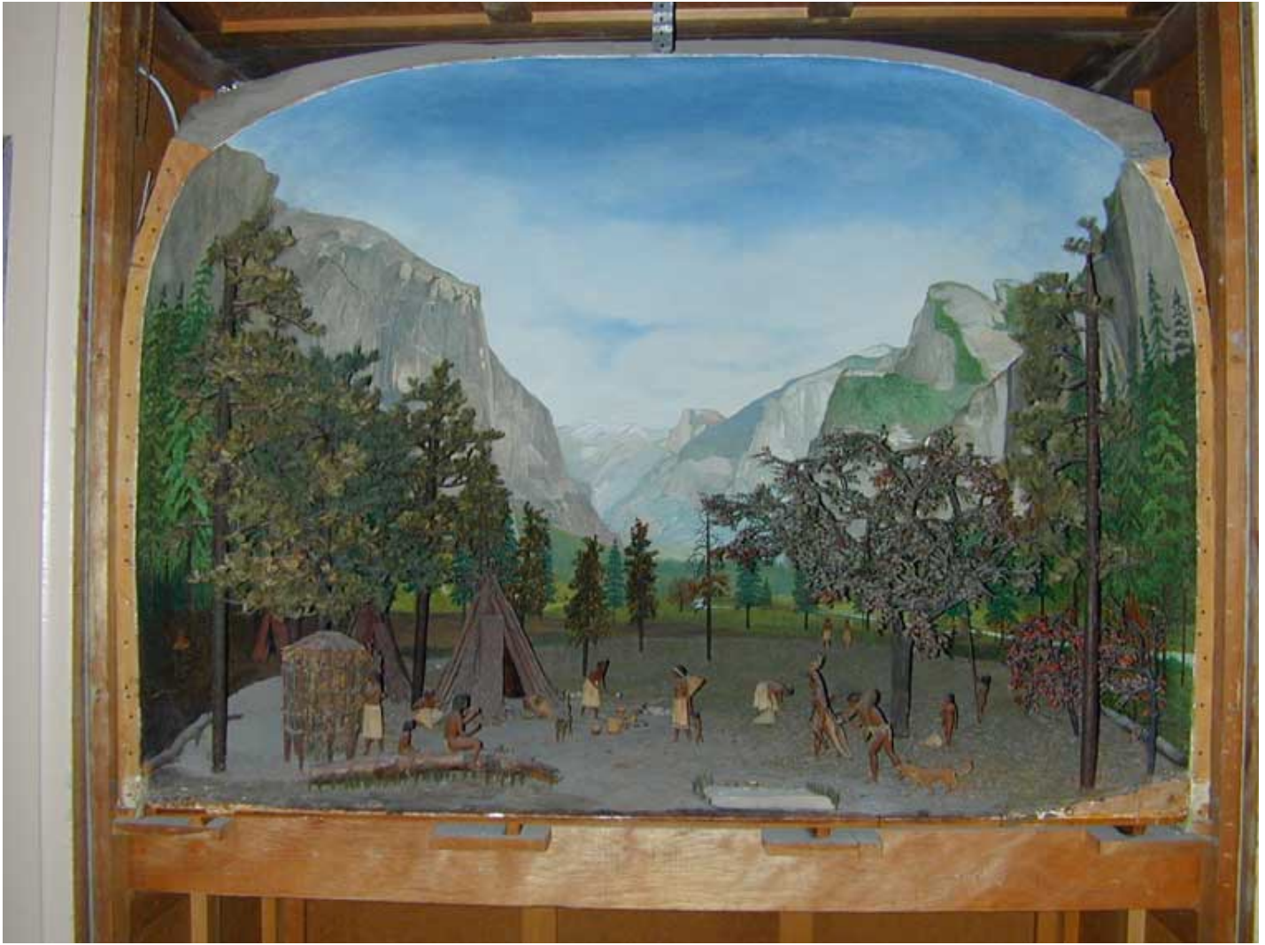
This is a recreation of the classic annual Ahwahneechee convention: TenayaCon, circa 1875

The Society for the Restoration of Half Dome has completed its feasibility study into its original plan. Sadly, the results stated that the idea of using granite from Kitchen Supply stores doesn't seem to be workable.